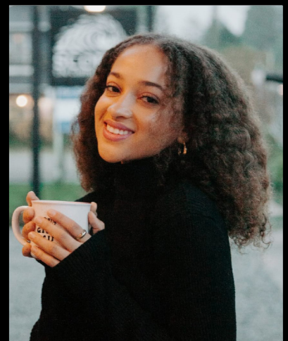
Samantha Lee Merchandising